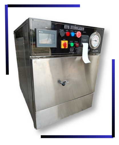
TABLE TOP ETO STERILIZER